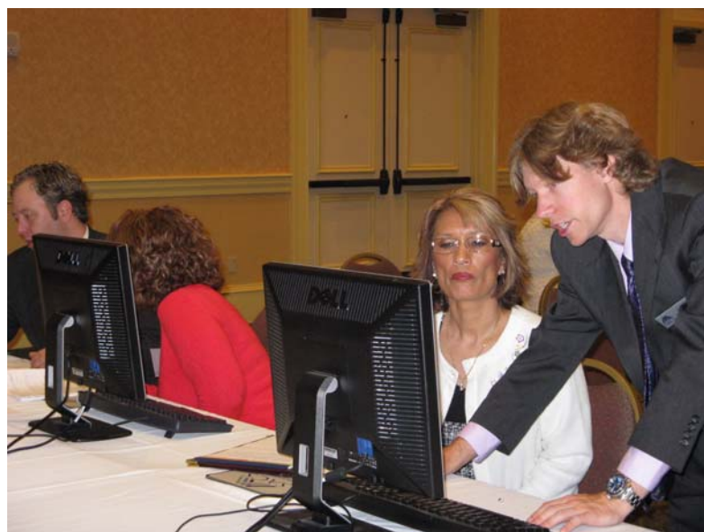
One-on-one training at the 2010 SACS User Conference.