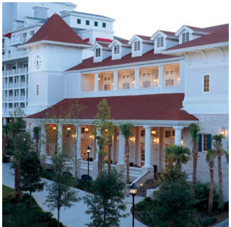
Baytowne Conference Center

The 2013 Conference is scheduled for March 12 th – 13 th , 2013, at the Baytowne Conference Center in Destin, Florida. Keep your calendar clear for this exciting conference. We will be sending you registration information this summer.